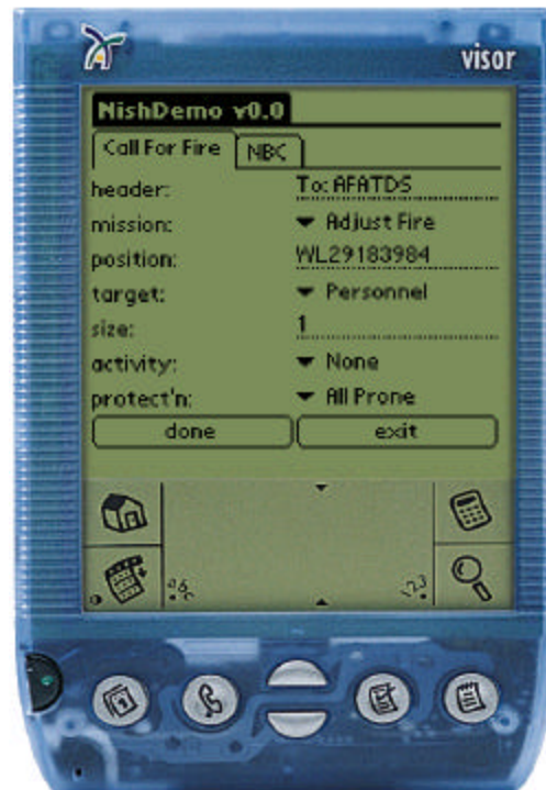
Figure 3: Sample User Interface Running on POSE

The use of emulators is a powerful tool. The use of POSE and the pJava emulators facilitated rapid development of code for three different platforms (J2ME, pJava, and J2SE) concurrently. The emulators accelerated this development by removing the need to copy the application to each platform to test each change. In some cases, the use of emulators not only sped development but also enabled development. Since the currently available version of WHITEboard SDK required an emulator, the development of communications code that used Bluetooth could not have been accomplished without the Zucotto emulator. Software development would have been halted indefinitely waiting for the 2.0 version of WHITEboard, or for local development of a Bluetooth API.