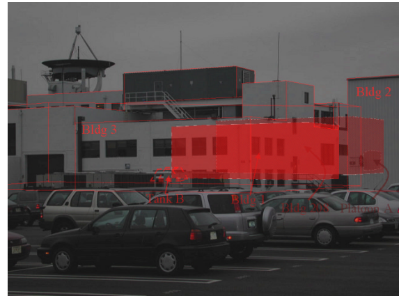
Figure 3: A sample protocol to show the location of occluded objects. The first three layers are shown with outlines of varying styles. The last three layers are shown with filled shapes of varying styles.

Domain analysis often includes activities such as use case development, user profiles, and user needs analysis. Use cases describe in detail specific usage contexts within which the system will be used, and for which the system should be designed. User profiles characterize an interactive system's intended operators and their actions while using the system. The process