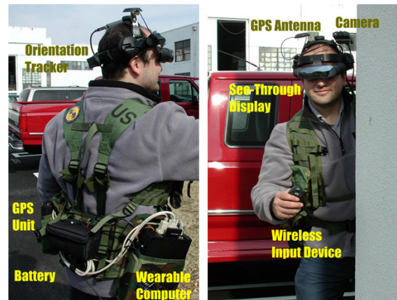
Figure 2: An annotated view of the hardware configuration of the current BARS prototype.

Built from commercial, off-the-shelf (COTS) products, the mobile prototype for BARS is composed of (Figure 2):