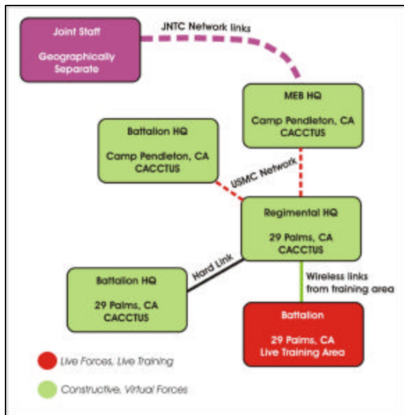
Figure 5. A CACCTUS Training Event

Interestingly enough, CACCTUS has existed as a name and capability (consistent with what is currently being built) since 2000. With a focus from the beginning on exploiting the live, virtual, and constructive environments, it will easily fit into the Joint National Training Capability (JNTC).