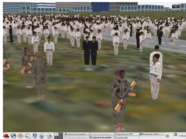
Figure 2 3D Rendered display from a SAF

A few workstations on a local area network (LAN) can support simulations of a few thousand entities in a typical JSAF run. For this size simulation, a simple broadcast of all data to all nodes is sufficient. Each node discards data that is not of interest to it. The Run Time Infrastructure (RTI) controls this activity. When the simulation is extended to tens of thousands of entities and scores of workstations, broadcast is not sufficient. UDP multicast has proven to be a good solution to this issue, in lieu of the simple broadcast. In this case, each simulator receives only the data to which it has subscribed, i.e. in which it has a stated interest. This leaves enough compute capacity for data management and visualization, e.g. a three dimensional, rendered view of the urban area, shown in Figure 2.