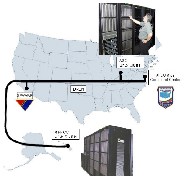
Figure 3 Notional JFCOM Net Map

Communications between the sites are provided by the Defense Research and Engineering Network (DREN). Experiments for Urban Resolve have been both unclassified and classified. The work that has been undertaken for CENTCOM also requires encryption of the communications’ links. The Linux operating system is common across the net (usually Fedora, but also Red Hat Enterprise) and most of the programs are written in C++, with a smattering of Java.