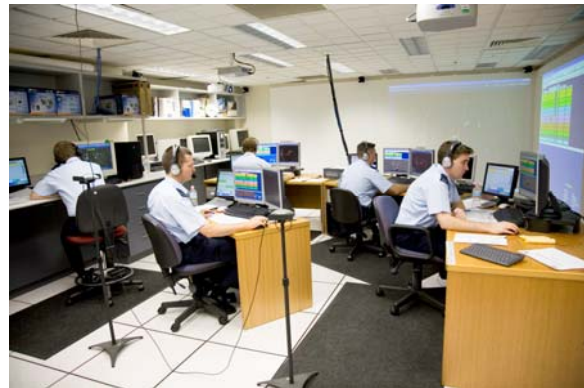
Figure 3. DSTO's Simulated C3 Environment

Several key components of the Air Defence Ground Environment Simulator (ADGESIM), a suite of simulation applications developed by DSTO for ABM training and commercially supported by Ytek Pty Ltd (Melbourne, Australia), were utilised during PL2. The ADGESIM Pilot Simulation Interface (PSI) provides scalable, real-time control for a variety of entity models via a customised version of the COTS product 'VR-Forces' (MÄK Technologies, Cambridge, MA). The PSI was used by a RAAF