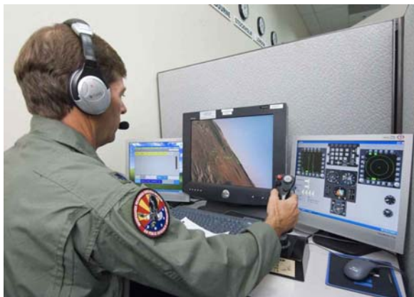
Figure 2. An AFRL Mesa F-16 Pilot Operating a Desktop Simulator in PL2

The desktop F-16 simulators consisted of PCs running SDS International LiteFlite software and AAcuity image generators. This flight code and image generator runs on standard personal computers. One 19 inch computer screen was used