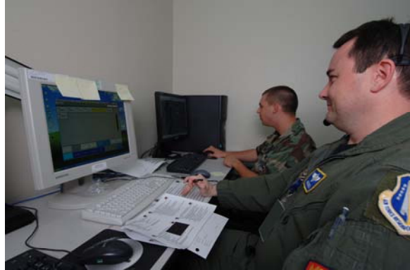
Figure 4. An AFRL Mesa SME Operating the XCITE Constructive Forces in PL2

To keep the pilots of the virtual simulators engaged as much as possible without disrupting the scenario play, the cockpits were periodically hot-swapped with the constructive forces. For example, one constructive formation of F-16s may have been formed up with the refueling tanker, a second formation may have been waiting at the base for launch, and a third formation may have been following a route to a holding point just