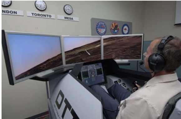
Figure 1. An AFRL Mesa DTT Cockpit Engages and Enemy Fighter

The desktop F-16 simulators consisted of PCs running SDS International LiteFlite software and AAcuity image generators. This flight code and image generator runs on standard personal computers. One 19 inch computer screen was used