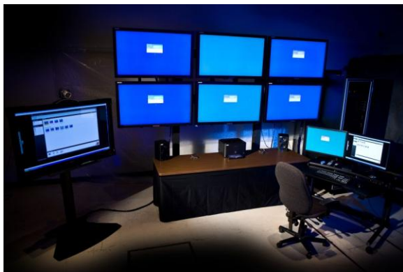
Figure 3. F-16 Follow-on Debrief System

The F-16 Follow-on MTC debrief system supports seating for up to 8 observers, an instructor, and a technical operator. There are six large 46” LCD displays for viewing the scenario playback. Data recorded for playback include DIS network data for situational awareness, cockpit display video, and cockpit switch repeaters. A video teleconferencing system provides communication with remote participants. A technical operator has a computer station for controlling the data playback and displays. A digital whiteboard allows annotations to be created and shared with the local and distributed participants.