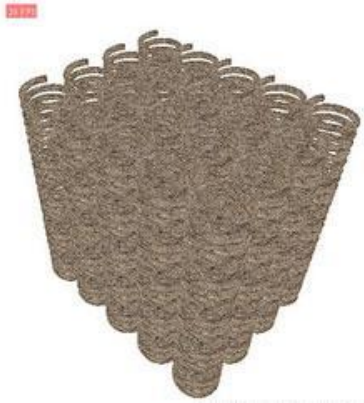
Figure 9. FP11 Beta Version of 100 20K Polygon Model

Thompson and Scabia revised their Behemoth Test to load more quickly and ran the same 100 20K-polygon springs, shown in Figure 9, that were used in FP11 Beta.