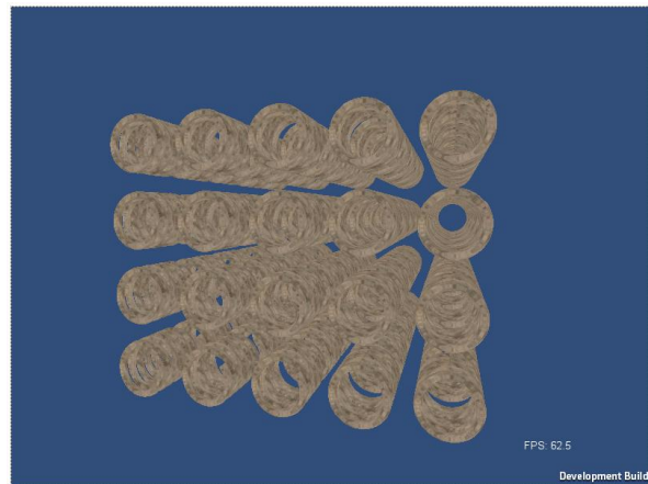
Figure 8. Unity Player Version of 2M-Polygon Model

The first test went beyond Scabia's Behemoth Test, experimenting with 100 of the 20K-polygon springs, shown in Figure 8.