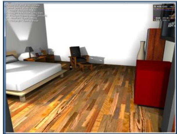
Figure 1. FP10 Version of Room

These statistics are visible to anyone viewing the demos online by reviewing the data box in the upper right-hand corner. Figures 1 and 2 display screen shots of the two versions of the room.