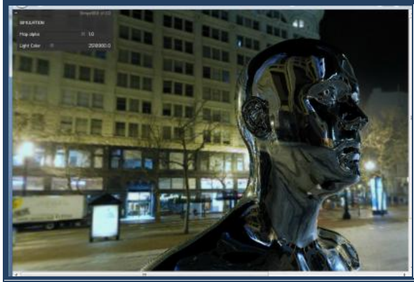
Figure 4. FP11 Beta Version of Reflective Head