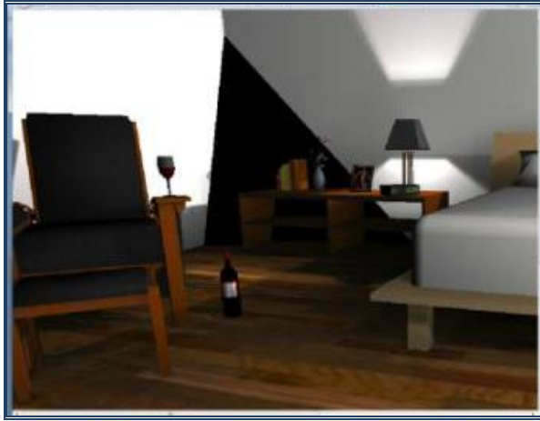
Figure 2. FP11 Beta Version of Room

It should be fairly obvious to anyone navigating the 3D room that the FP11 Beta version provides a much smoother experience. Specific data is shown in Table 1. Keep in mind that our testing indicates considerable variation across operating systems, browsers, and hardware including the GPU environment, but consistently points to excellent performance by FP11 Beta.