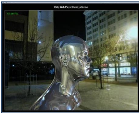
Figure 5. Unity Player Version of Reflective Head

Similar performance results were obtained in these tests which are summarized in Table 3. In both cases playback was smooth and seamless displaying a high depth of resolution, even with the fairly complex model.