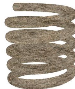
Figure 6. FP10 Version of 20K Triangle Model

His first quantitative comparison involved a 20K triangle model of a “stone spring” using the CPU-based drawTriangles call in FP10. The resultant scene, shown in Figure 6, ran at 10 fps.